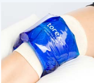
torex on knee Large # R6060