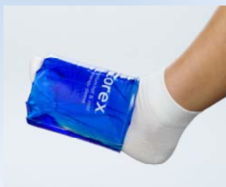
torex on foot Small # R4060