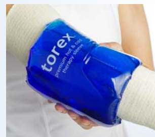
torex on elbow Medium # R5060