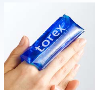
torex finger Finger # R2540