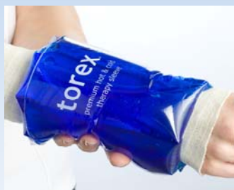
torex on wrist Small # R4060

Fast, effective & uniform treatment for limb soft-tissues.