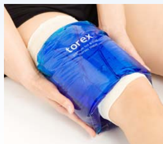
torex on thigh X Large # R7080